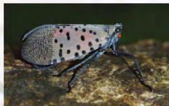
Here is a closeup of an adult lanternfly at rest with its wings folded.