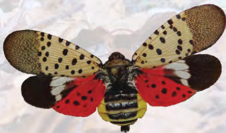
Here is a specimen of the adult with its wings spread to make the brightly-colored rear wings visible.

Spotted Lanternfly have not been shown to invade homes like Japanese Beetles or Brown Marmorated Stinkbugs. They do have indirect effects on homes and personal property related to, "sooty mold." While the adult Spotted Lanternfly feeds on the tree's sap, it excretes waste, called "honeydew." This honeydew is partially digested sap and retains a lot of sugar. Large amounts of honeydew drop from the adults as they forage on the different parts of the tree. Soon, black, sooty mold begins growing down the trunk of the tree and on anything under the tree that has come into contact with honeydew. This can damage decks, patio furniture and even homes.