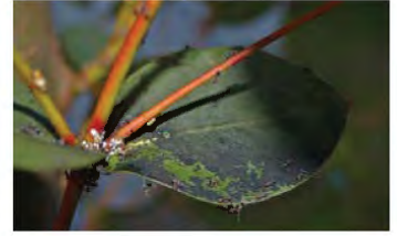
Here you see the sooty mold that grows on the Lanternfly waste, or honeydew. Note the presence of ants attracted to the sap exposed by the Lanternfly.

Spotted Lanternfly have not been shown to invade homes like Japanese Beetles or Brown Marmorated Stinkbugs. They do have indirect effects on homes and personal property related to, "sooty mold." While the adult Spotted Lanternfly feeds on the tree's sap, it excretes waste, called "honeydew." This honeydew is partially digested sap and retains a lot of sugar. Large amounts of honeydew drop from the adults as they forage on the different parts of the tree. Soon, black, sooty mold begins growing down the trunk of the tree and on anything under the tree that has come into contact with honeydew. This can damage decks, patio furniture and even homes.