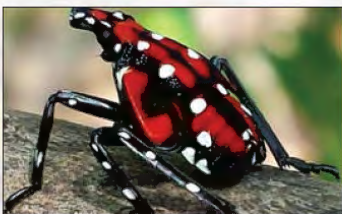
Here is a closeup view of the final nymph stage. Note the change in coloration from earlier instars.

Spotted Lanternfly are not dangerous to people but are a danger to both crops and trees. The young Spotted Lanternfly, or nymph forms, target leaves and other softer parts of plants. Trees and plants suffer from defoliation as the nymphs feed on them. Adult Spotted Lanternfly use their long, pointed mouth parts to drive through the bark of trees and feed on sap. This causes a wound on the tree that will continue to weep after the adult has moved on. This affects the tree's health and can even result in its death.