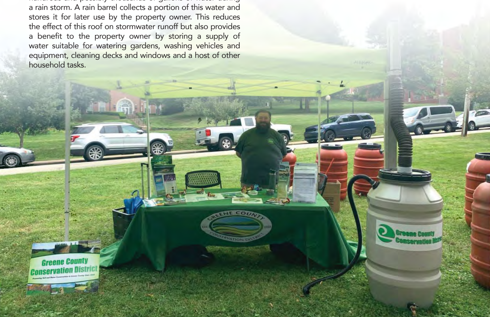
Photo Caption: Watershed Specialist, Jared Zinn, at the Conservation District booth during the Rain Day festival.

If you would like to learn more about stormwater management, rain barrels, or future Conservation District workshops, please contact the Conservation District at 724-852-5278.