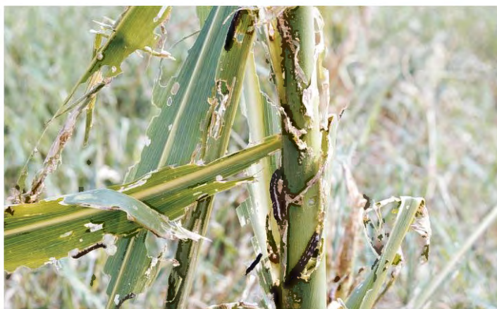
Corn infested with Fall Armyworm caterpillars.

The Armyworm causes damage to plants by feeding on leaves. This caterpillar affects a wide variety of plants as it is known to impact over 80 different species. These include, alfalfa, barley, Bermudagrass, buckwheat, cotton, clover, corn, oat, millet, peanut, rice, ryegrass, sorghum, sugarbeet, Sudangrass, soybean, sugarcane, timothy, tobacco, wheat as well as sweet and white corn.