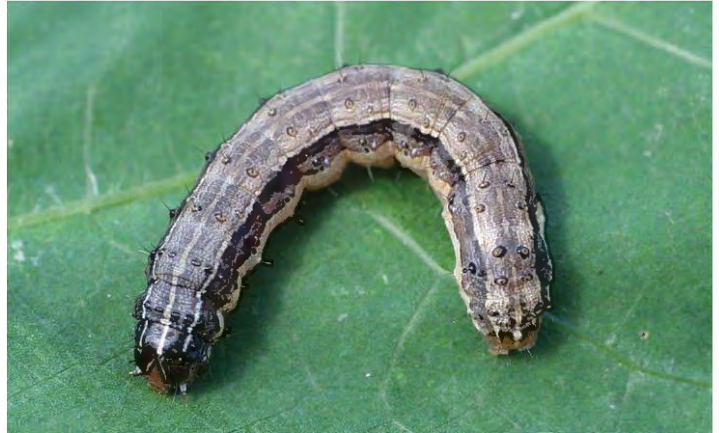
A mature Fall Armyworm caterpillar ( Spodoptera frugiperda).

The Fall Armyworm is a caterpillar that is native to North America although it is uncommon in Pennsylvania. The Armyworm is a temperate species and cannot survive Pennsylvania's winters. They generally overwinter in southern states like Florida and Texas. They do migrate northward throughout the year but rarely reach Pennsylvania. It is thought that these current infestations are driven by recent storms carrying the moths further north than usual.