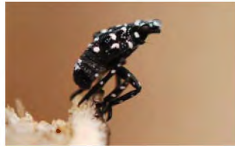
Here is a closeup view of the nymph during its earlier instars.

Spotted Lanternfly are not dangerous to people but are a danger to both crops and trees. The young Spotted Lanternfly, or nymph forms, target leaves and other softer parts of plants. Trees and plants suffer from defoliation as the nymphs feed on them. Adult Spotted Lanternfly use their long, pointed mouth parts to drive through the bark of trees and feed on sap. This causes a wound on the tree that will continue to weep after the adult has moved on. This affects the tree's health and can even result in its death.