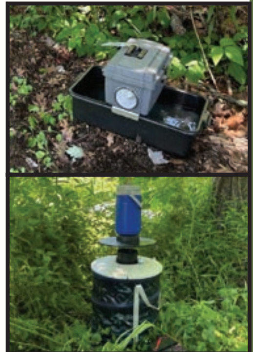
Figure 1. Two trap types that capture mosquitoes for surveillance and testing.

In 2024, three diseases were tested for in Greene County mosquitoes: West Nile Virus, St. Louis Encephalitis, and Jamestown Canyon Virus. In the twelve areas that were tested throughout the year, 4 areas tested positive for West Nile Virus: 2 positives in Carmichaels, 2 Positives in Rice's Landing, 2 Positives, Crucible, and 1 in Mount Morris. Notifications were made to local municipal officials and those living nearby the positive mosquito sites.